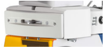
OBN 141/OBN 147

Semi apochromatic objectives available as accessories (see model outfit list Page 25)