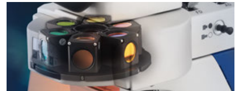
Sextuple filter wheel OBN 148